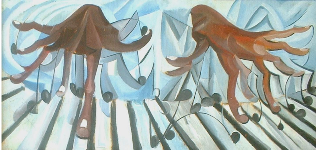
“Hands of a Jazz Piano Player”