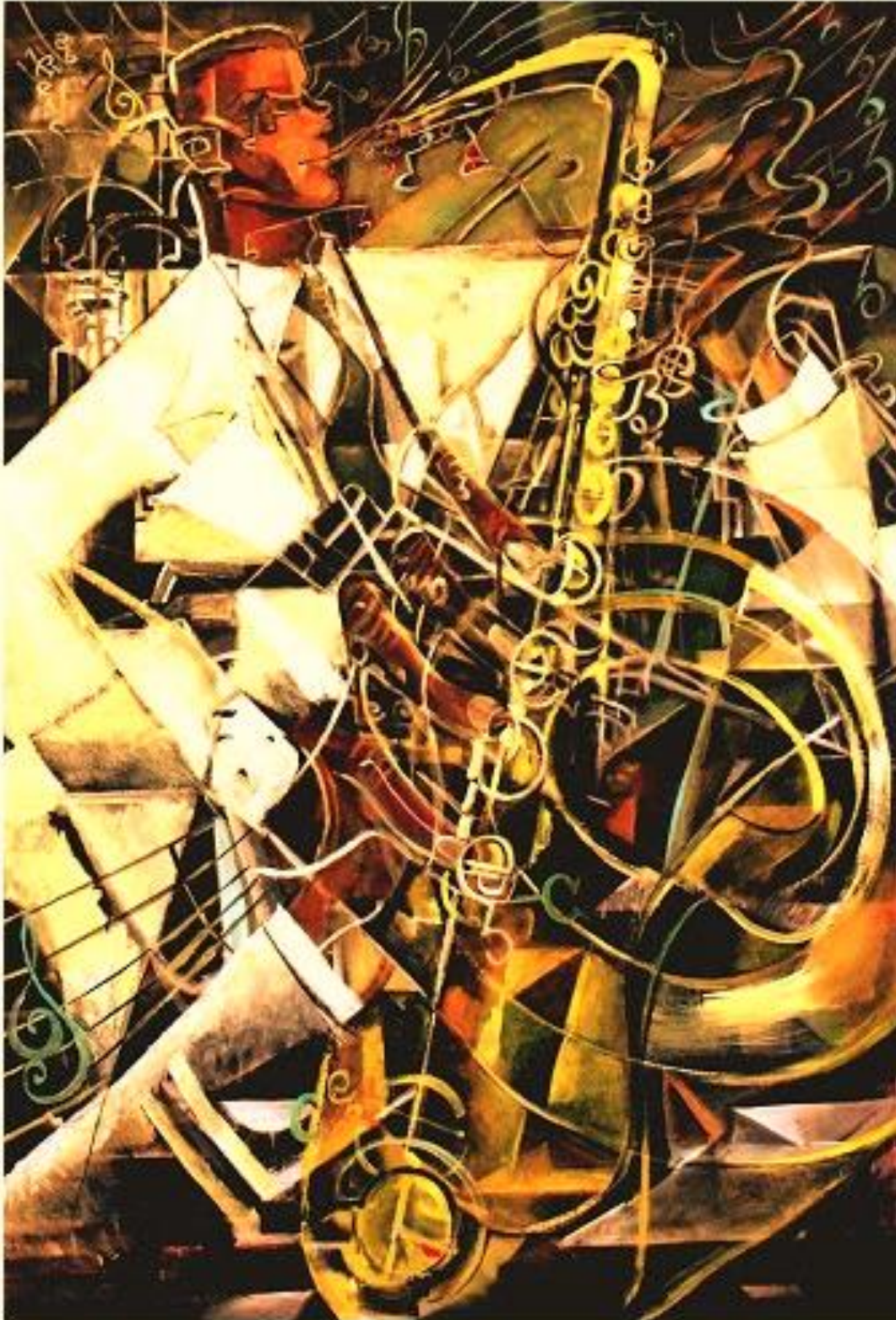
“A Horn Called Coltrane”