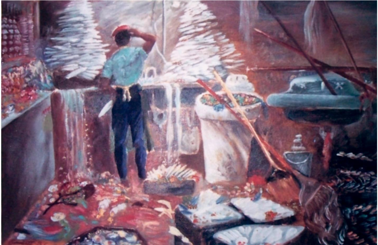
Self-Portrait as a Dishwasher in Washington, DC. Below Dizzy Gillespie.